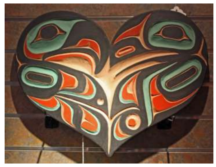
Eagle and Raven.