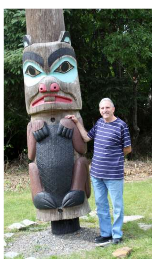
Totem and Pole.