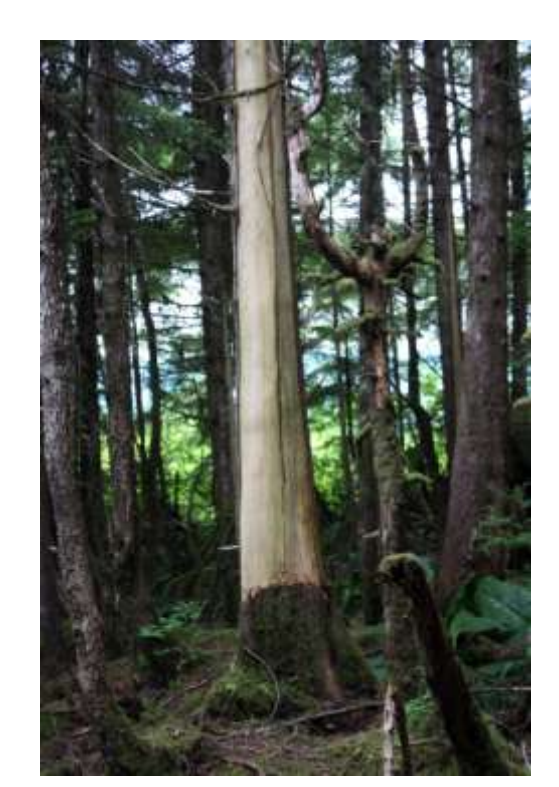
A tree is stripped of bark...