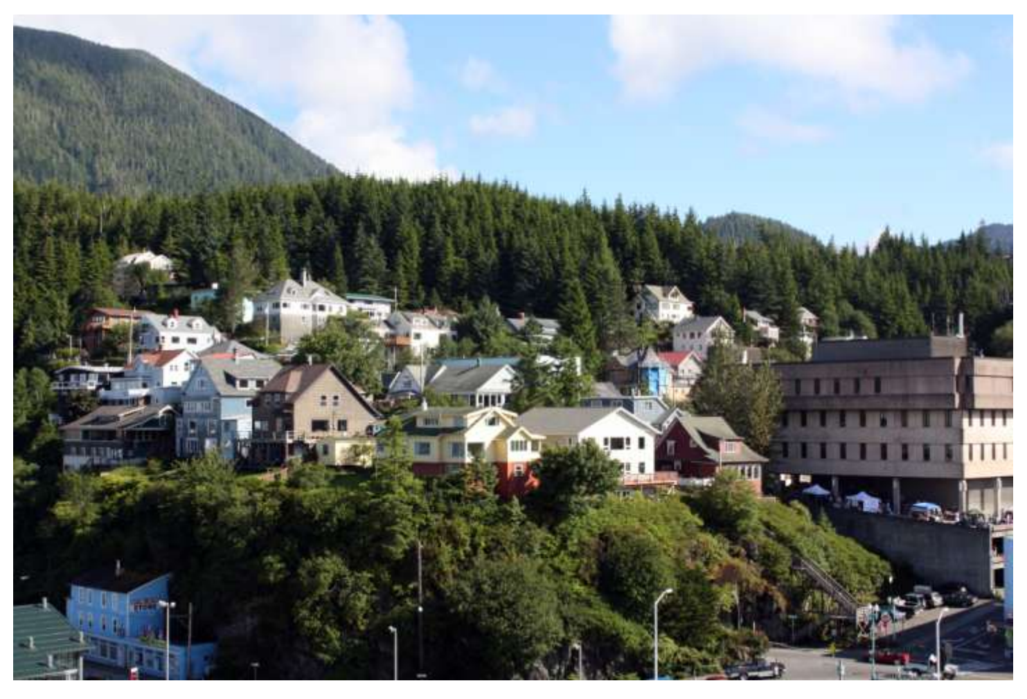
Clinging to the hillside and reached by walkways.