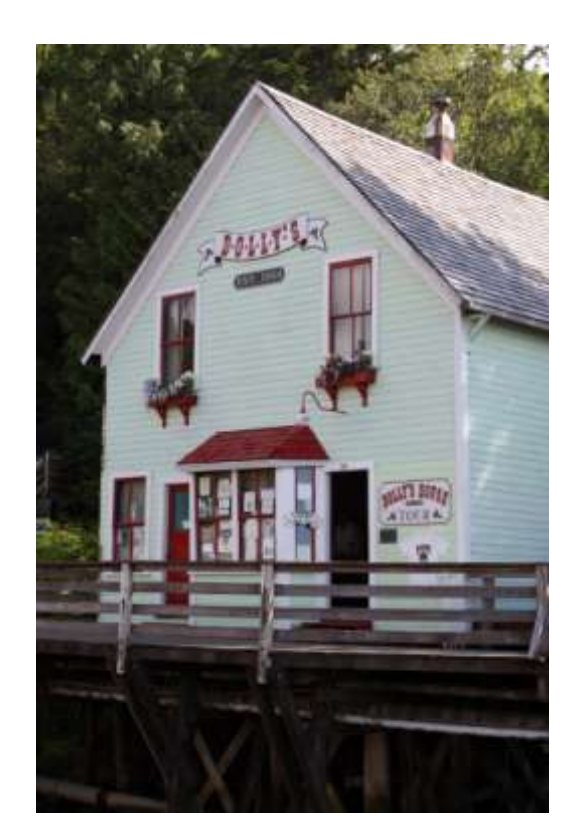
You can tour this cat house.