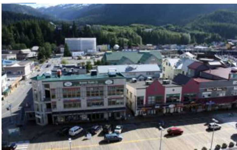
Built on fill.