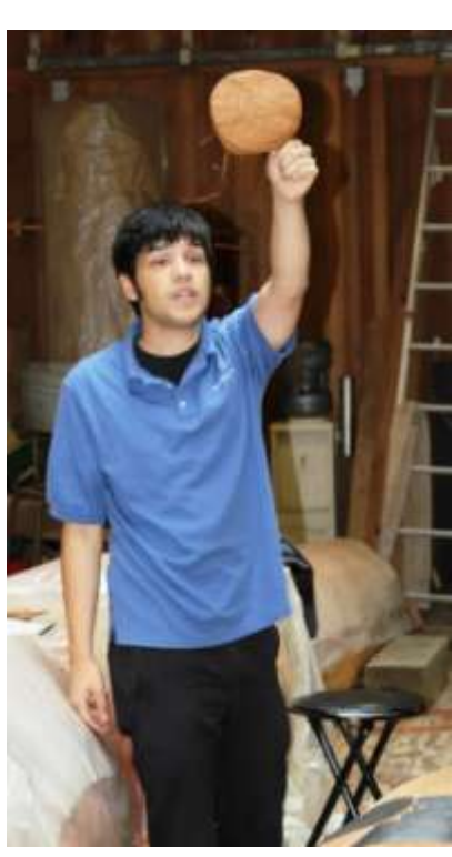
to make a basket.