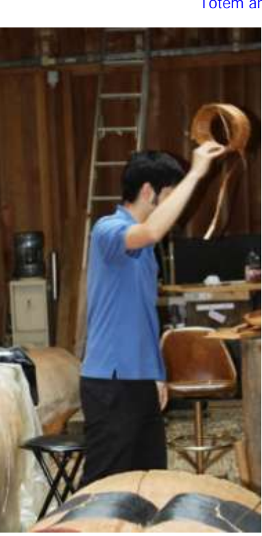
which is slit...