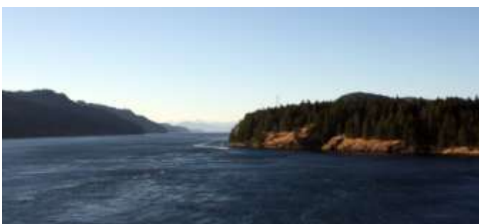
Up the coast to Canada.