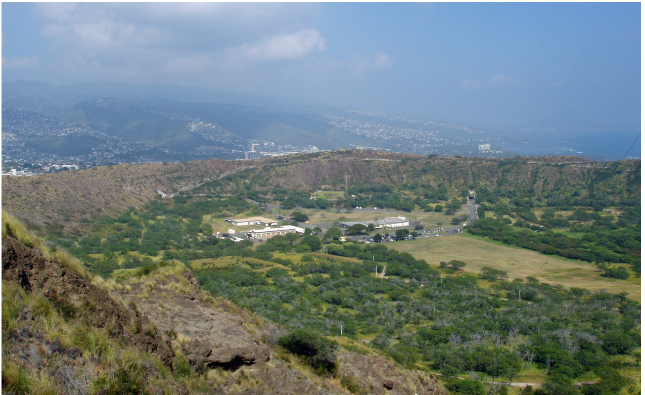
53. The crater.