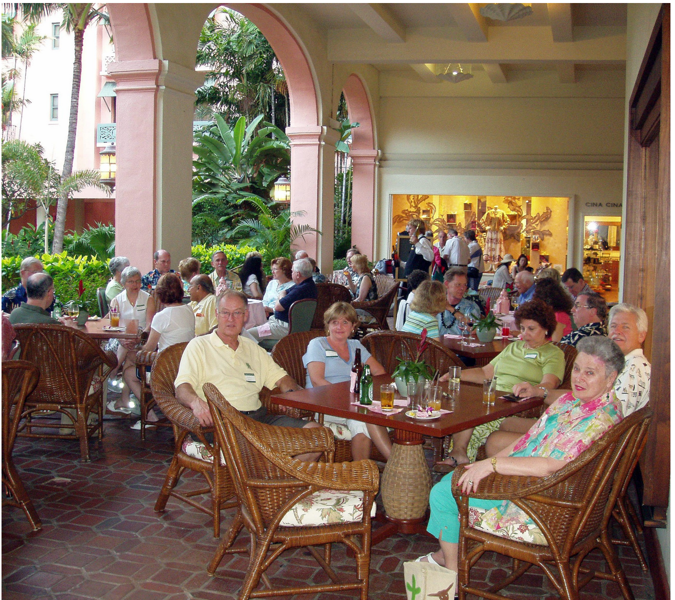
69. Getting to know you.....

"Would anyone like to learn to hula?" I cringe but several brave ladies take part. They are shown about six basic moves or steps which are then linked together to enact a dance.