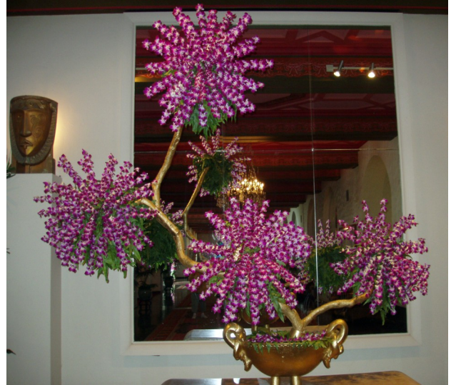
70. These are individual orchid flowers that have been attached to twigs. They can only last a day or two.