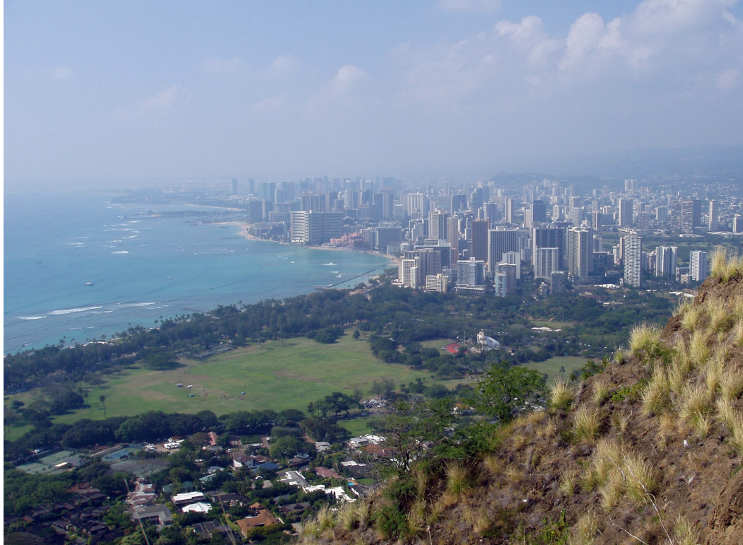
56. Waikiki Beach.