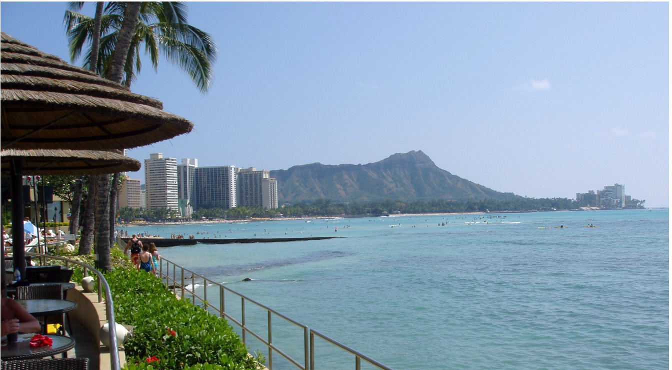
51. Diamond Head.

Southeast of Waikiki is an ancient volcanic crater, formed 350 million years ago. The highest point, Diamond Head 761ft, overlooks the sea, and is clearly visible from our hotel.