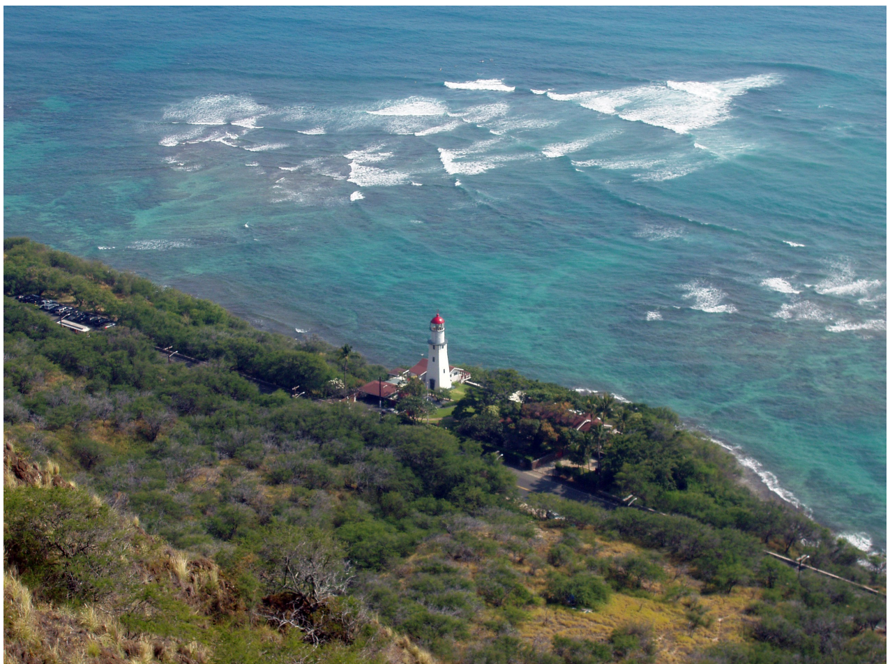
54. And there's the sea.