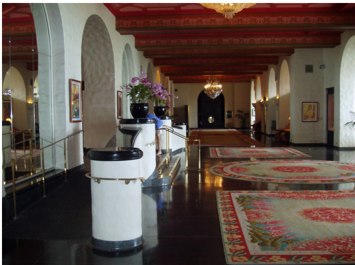
71. Don't wipe your feet on the carpet!