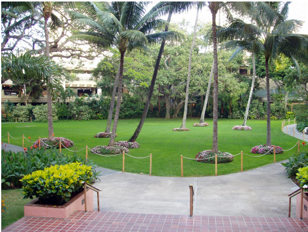
64. Hotel gardens.