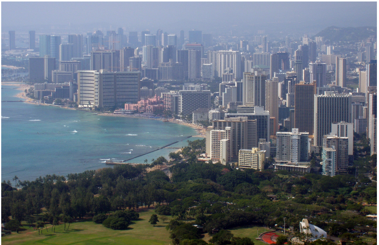
55. Zoom in to the Pink Palace.